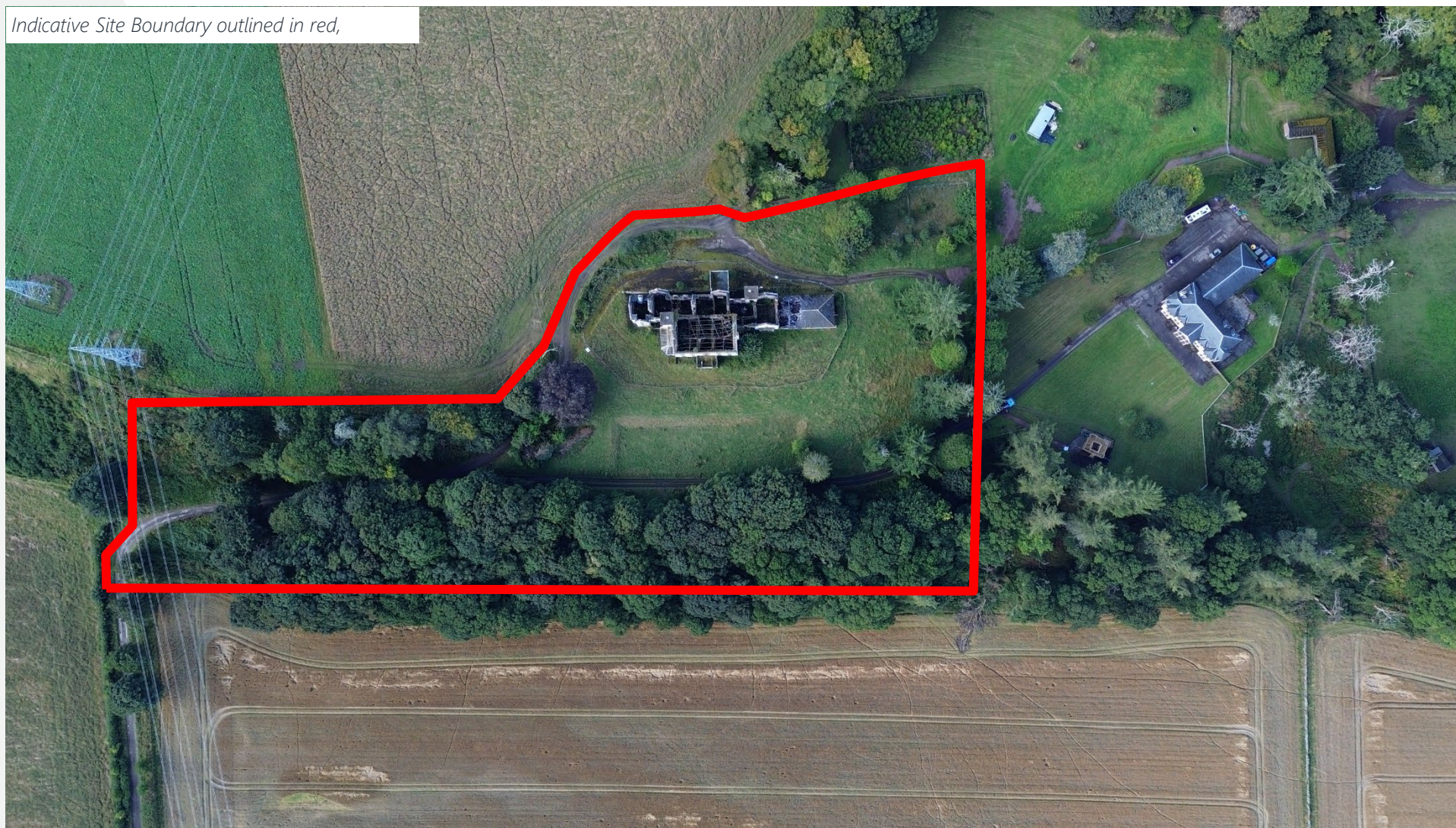
Indicative Site Boundary outlined in red,

FOR SALE BY UNCONDITIONAL ONLINE AUCTION