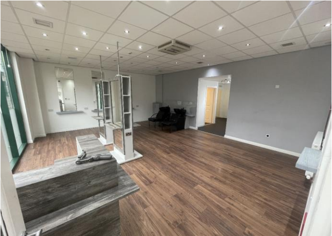
MAIN RETAIL/SERVICE SPACE

Internally, the subjects are laid out to provide a treatment room to the front, followed by the main retail/service accommodation. To the rear of the unit there is another treatment room, W.C facilities and a kitchen. The flooring is solid and features a wooden style overlay across the premises. The walls are painted/papered plasterboard, with the ceilings being an acoustic suspended design. Artificial lighting is provided throughout via spotlight fitments, with pendant lights at the window boundary.