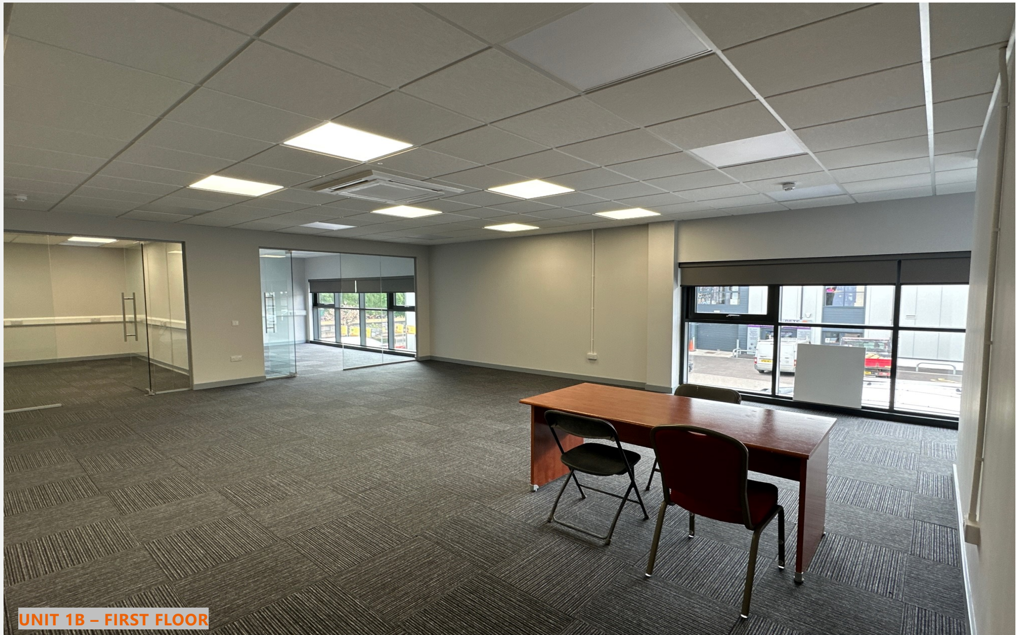
UNIT 1B – FIRST FLOOR