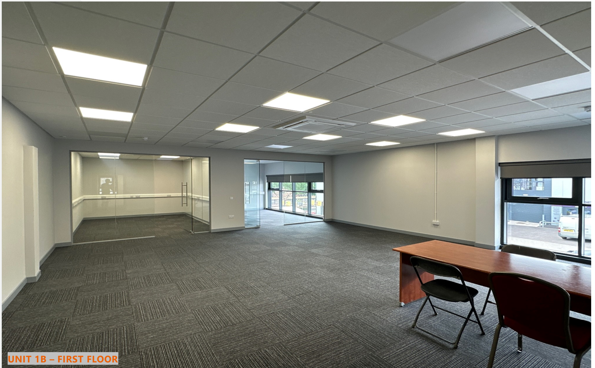
UNIT 1B – FIRST FLOOR