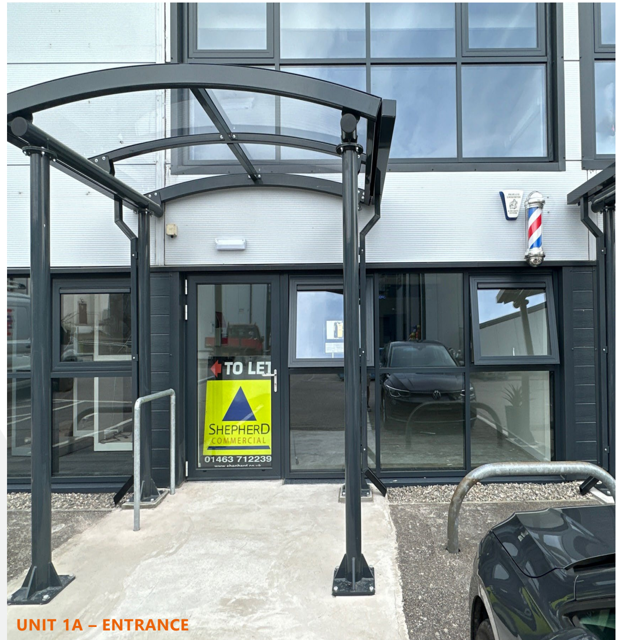
UNIT 1A – ENTRANCE