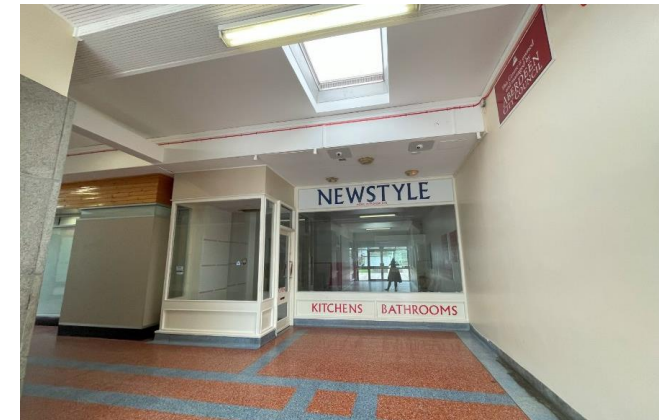
UNIT 7 (ACCESSED INTERNALLY)

The subjects are located on Provost Watt Drive, which is within the Kincorth area located southwest of Aberdeen city centre. The subjects are located within an established shopping arcade which serves the locale. Other occupiers include the Spar, Dolphin Fish & Chips, The Chef Takeaway and Sharron's Hair Studio.