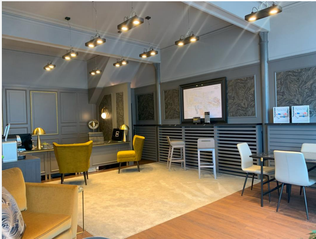
Ground Floor Accommodation