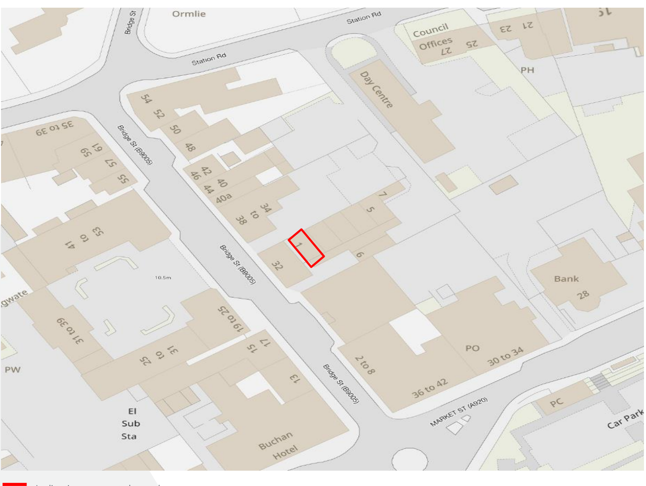
Indicative property boundary

Surrounding properties are in a mix of commercial and residential usage, with commercial occupiers in the vicinity comprising a variety of local and national occupiers. Within the shopping parade occupiers include Morrisons Daily, Jules Healing Gems, Yumi Asian Cuisineand Old Skool Barbers.