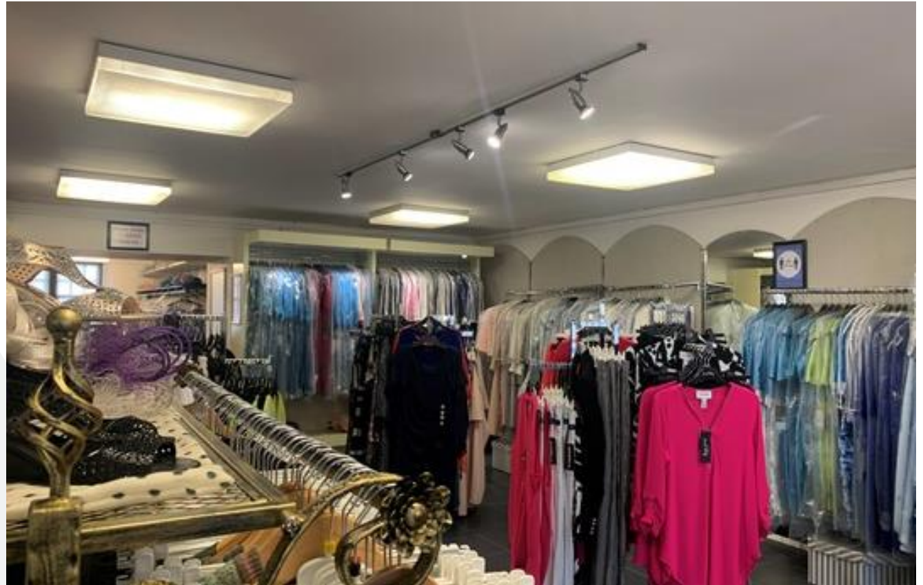
GROUND FLOOR RETAILING ACCOMMODATION

There is potential for the building to be sub-divided to suit occupiers needs.